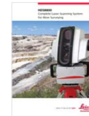
Leica HDS8800 Product information and specifications