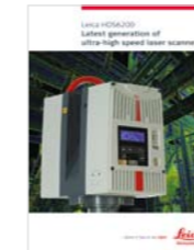
Leica HDS6200 Product information and specifications