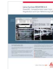
Leica Cyclone REGISTER Product information