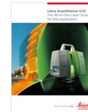
Leica Scanstation C10 Product information and specifications

Laser class1 in accordance with IEC 60825-1 resp. EN 60825